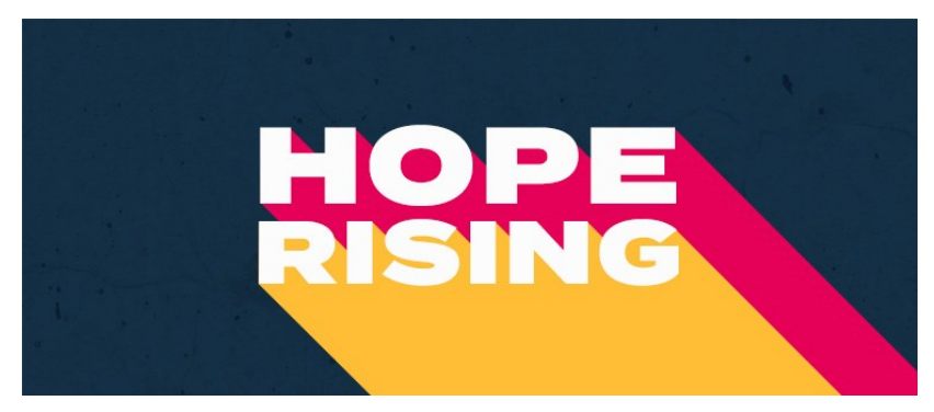
Hope Makes Champions Out of Underdogs May 1-2, 2021